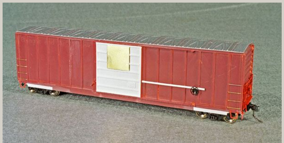
All building work done and all kit details added.

The details which came with the kit were added as supplied. The door opener details, defect card, and placard were added. The door opener is made from styrene HO Scale 1 X 3 and a Kadee brake wheel. Ironically if a 14" Evergreen strip is used, and there is no waste when cutting the door pieces, what remains of the strip is exactly the length needed for the door opener. The defect card is made using a piece of .040 styrene cut to size. The face of the defect card was then scribed to simulate metal guides holding three pieces of wood. The placards were made using .003 shim brass.